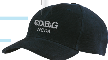
CD Week Structured Cap