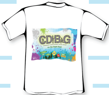
CD Week Heavy White Short-Sleeve Tee Shirt