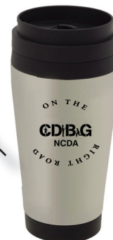
CD Week Stainless Steel Hot & Cold Travel Mug