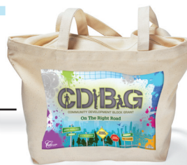
CD Week Tote Bag