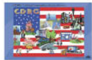
6" x 4" Postcard