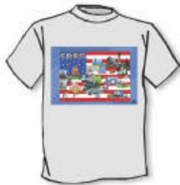
Gray Short-sleeve T-shirt

National Community Development Association 522 21st Street, NW Suite 120 Washington, DC 20006 tel: 202.293.7587 fax: 202.887.5546 e-mail: ncda@ncdaonline.org www.ncdaonline.org