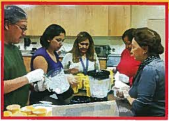
Mission Community Hospital Diabetes Teaching Kitchen City of San Fernando